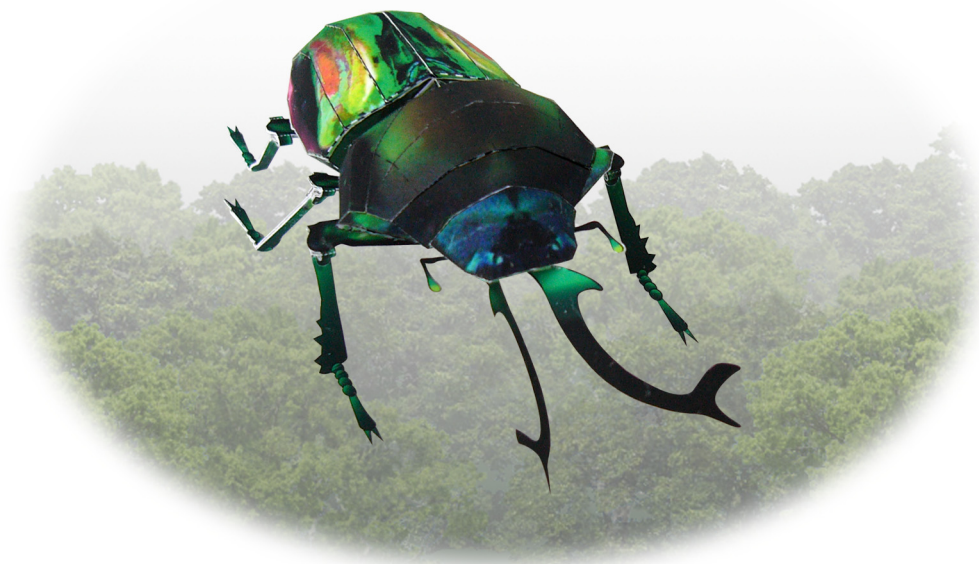
View of completed model